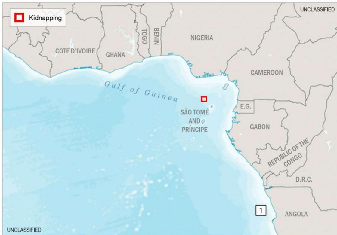
(U) Figure 1. Piracy and Armed Robbery in the West Africa – Gulf of Guinea