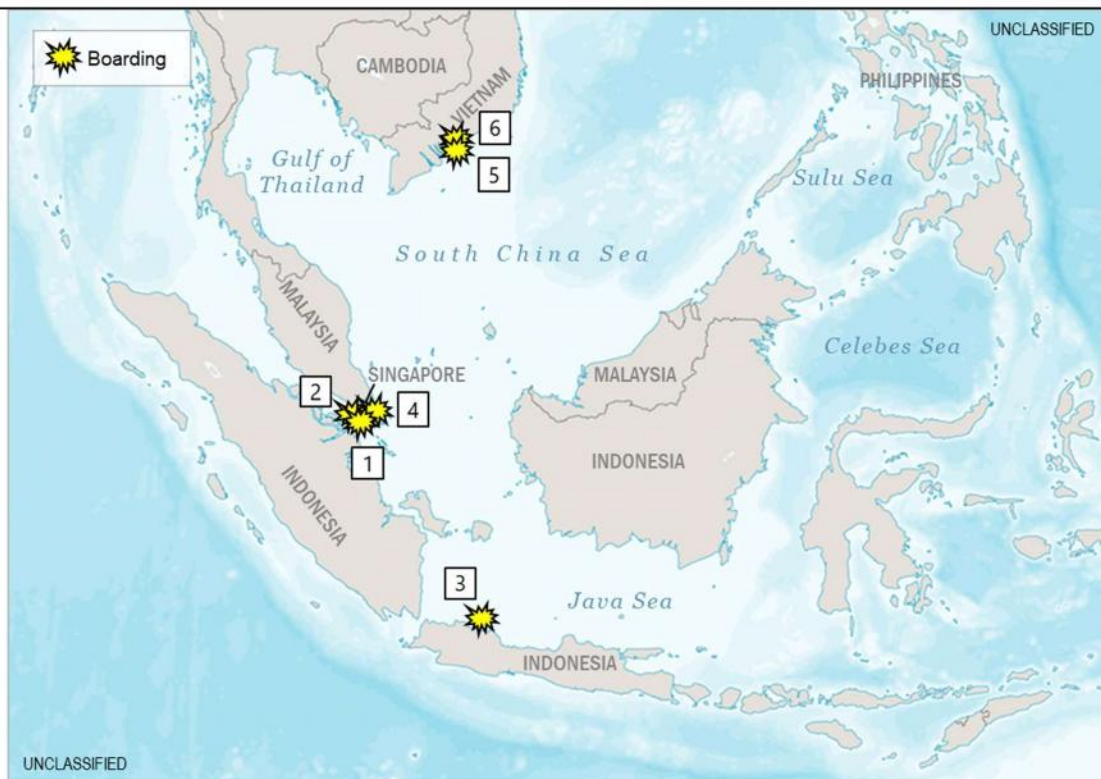
(U) Figure 2. Piracy and Armed Robbery at Sea in Southeast Asia